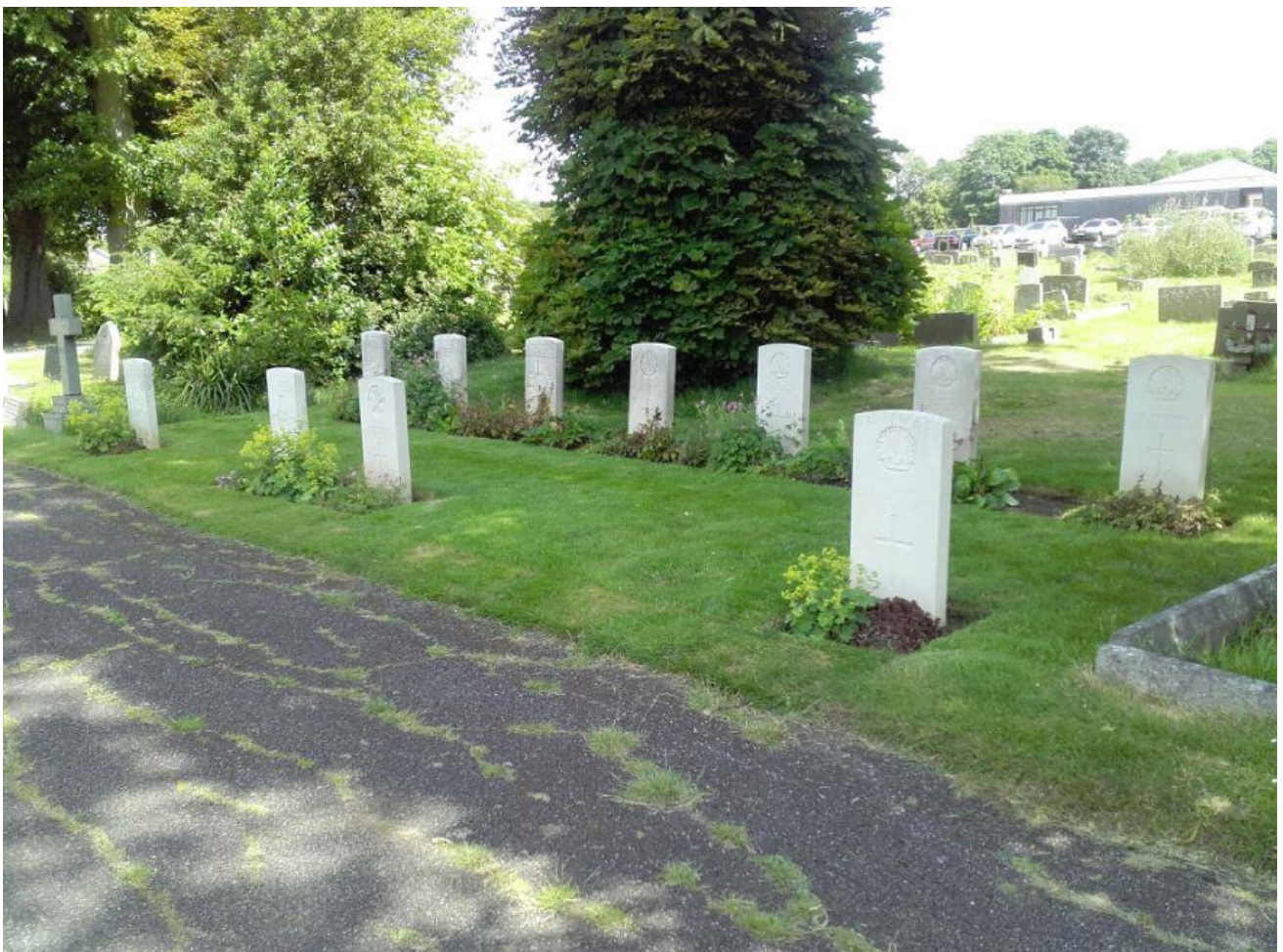
Grantham Cemetery – Australian Plot