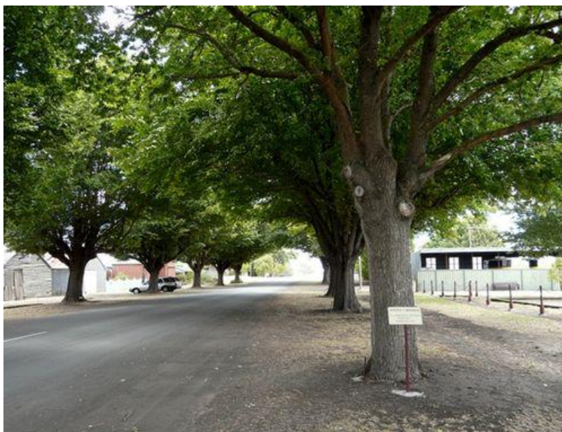
Avenue of Honour – Wallace Street, Beeac