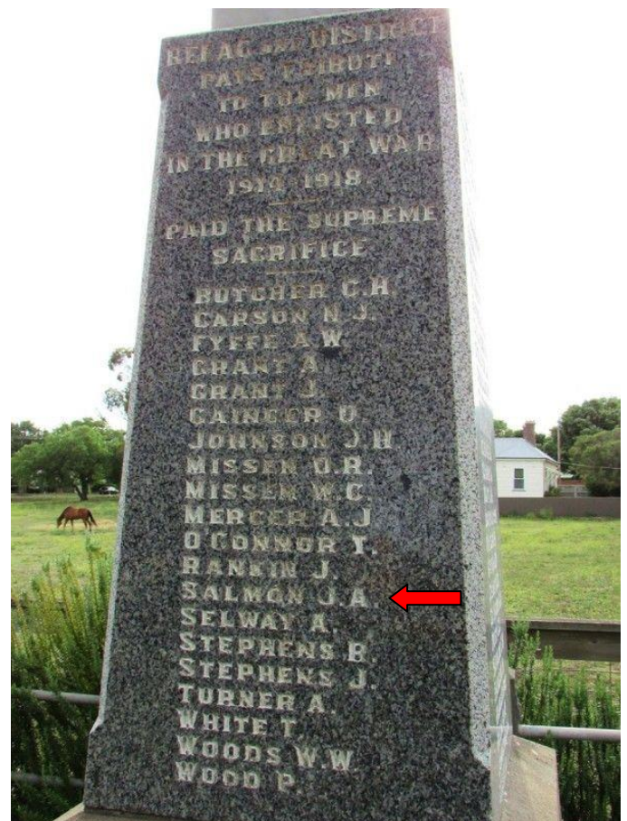
Beeac War Memorial